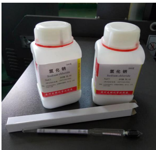
Sodium chloride (testing salt)